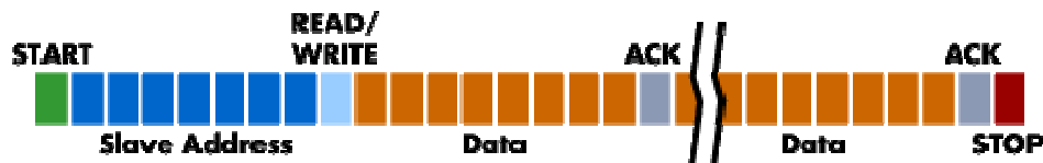
Figure 2: I2C Communication Protocol

Since there are only two wires, this protocol includes the extra overhead of an addressing mechanism and an acknowledgement mechanism